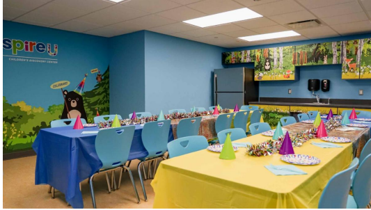
Blue Party Room