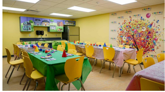
Yellow Party Room